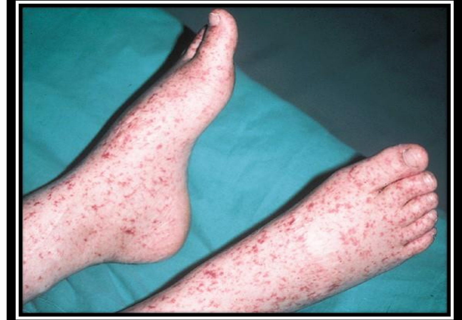
Skin lesions- common symptom of Tularemia