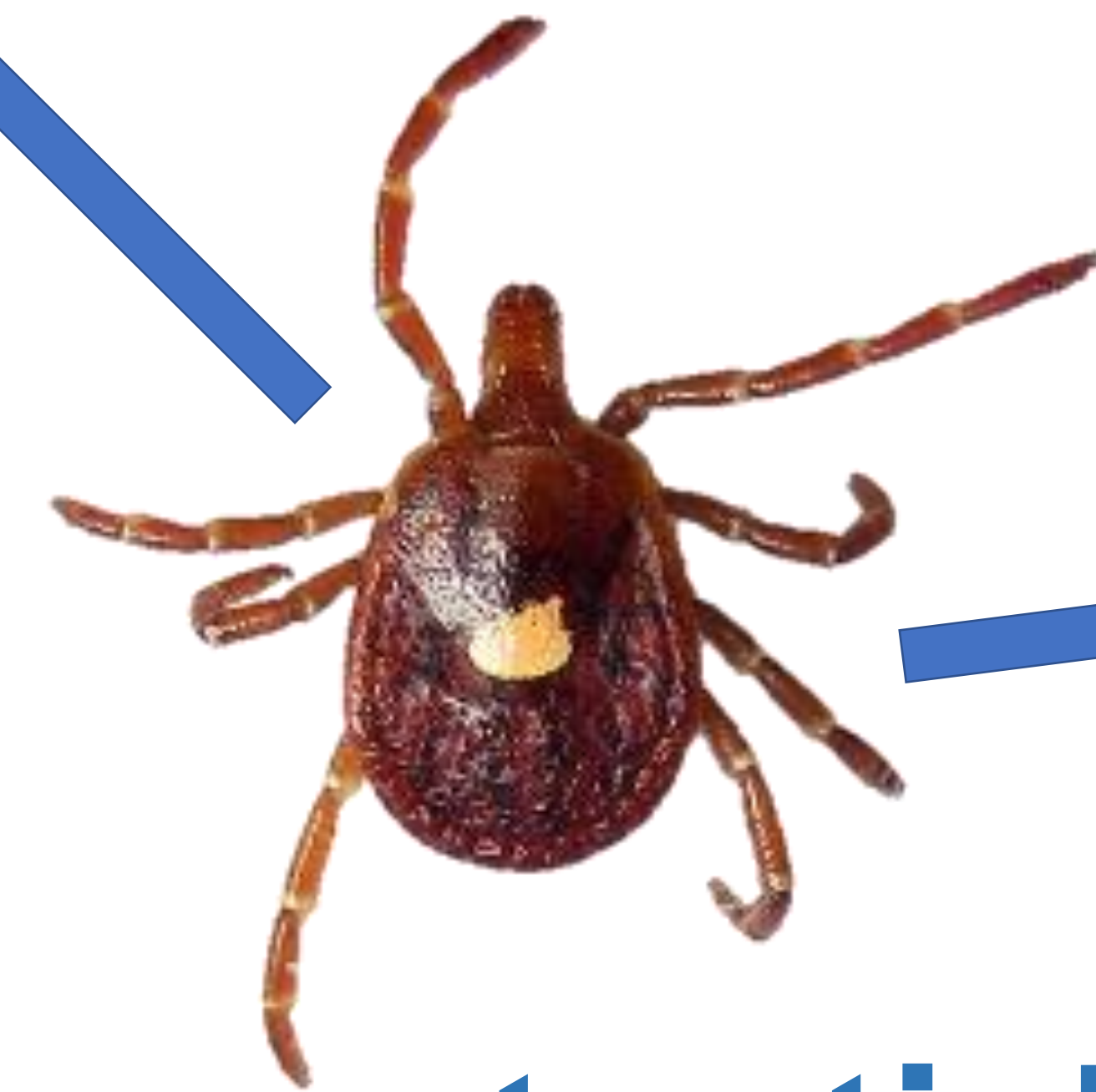
Lone star tick

Affected Species: humans, rabbits, rodents, cats, dogs, sheep, many mammalian species