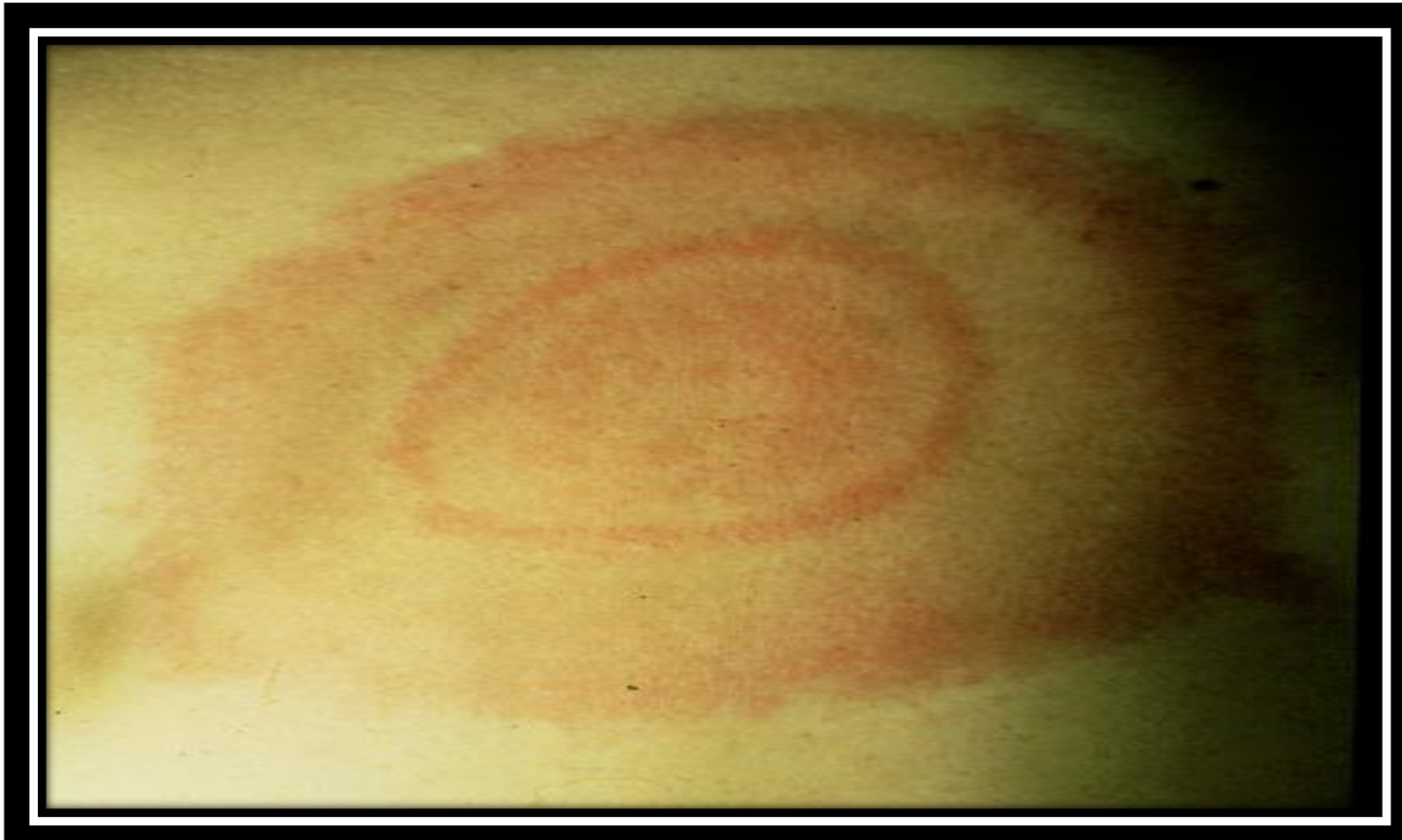
Bullseye rash- common symptom of Lyme disease and STARI